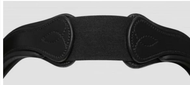
The Passier Fantastic Bridle Crownpiece (pictured above) is not permitted.