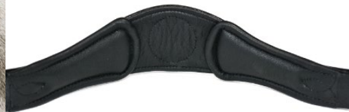
The PS of Sweden Nirak Bridle (pictured above) is not permitted due to the increased thickness of the crownpiece on each side of the poll.

Any other crownpiece of similar construction is not permitted.